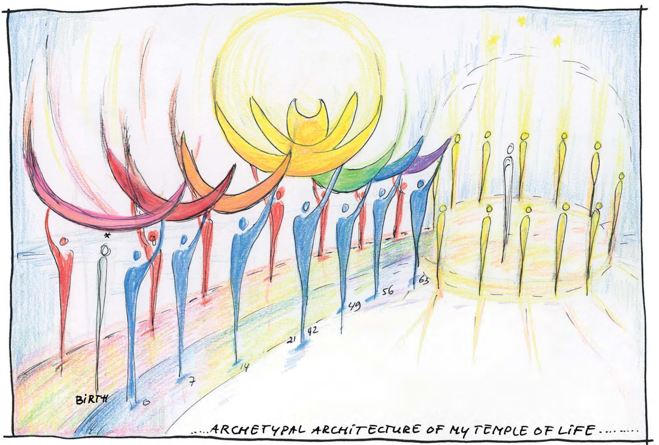
.....ARCHETYPAL ARCHITECTURE OF MY TEMPLE OF LIFE.....